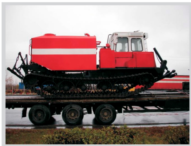
In the picture: Loading of a forest fire-fighting tractor

In 2007 the company also concluded procurement contracts with Ningbo Ruyi Joint Stock Co., Ltd (China) and E-P EQUIPMENT CO., LTD. (China) which manufacture all the range of handling equipment. Sibir-Technika started direct import from the manufacturing plants in China.