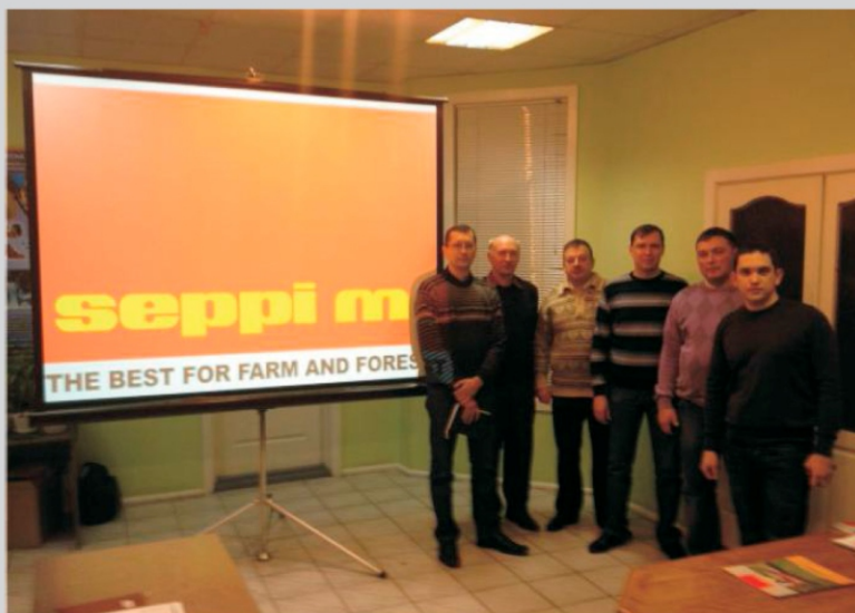
In the picture: training of Sibir-Technika's employees