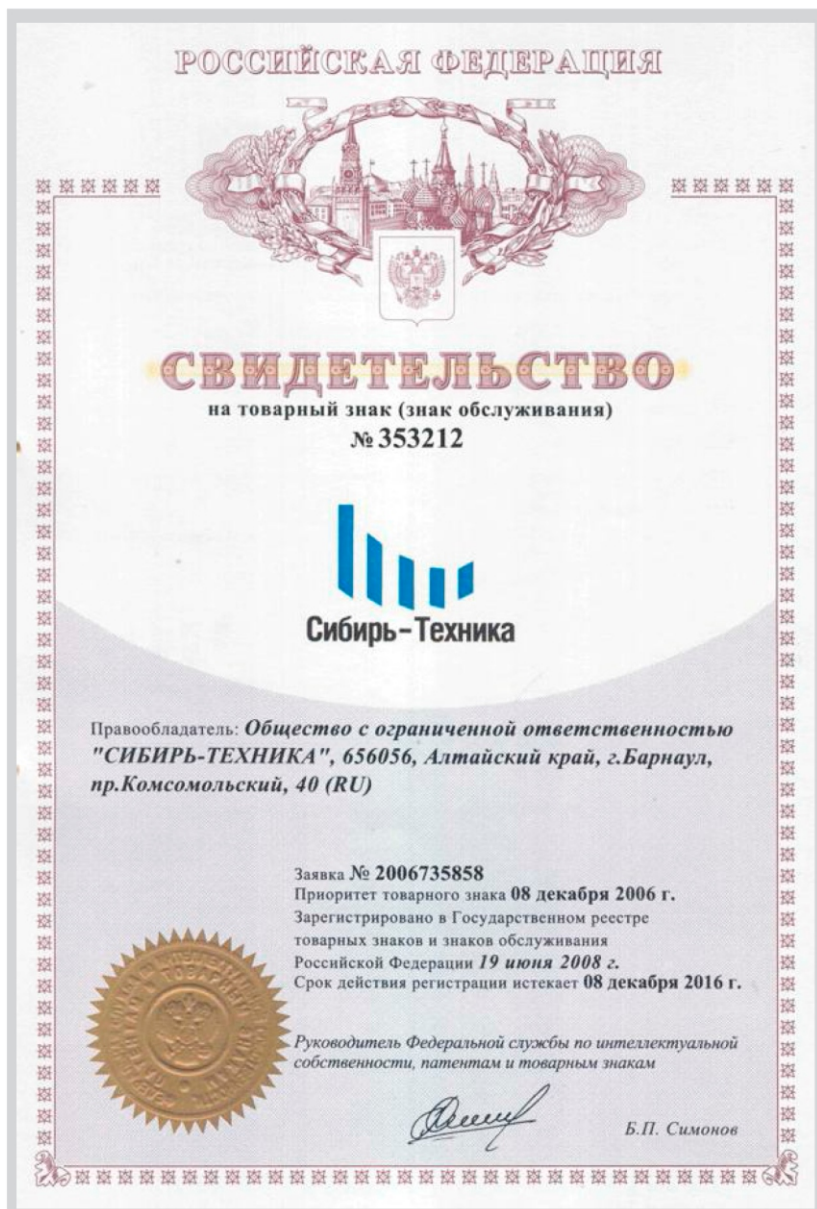
Certificate of Sibir-Technika, LLC trademark (picture is at the right)

The company formed an export/import department within its structure in order to focus in cooperation with foreign partners.