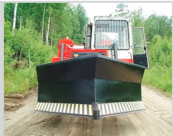
In the picture: the first trial testing of TLP-4M forest fire-fighting tractor, in 2003

According to the results of 2002-2004 Sibir-Technika became a leader among all dealers of Altaiskiy tractor, OAO, being the best at sales of skidding machines and carrier vehicles. The company sold around 70% of skidding machines and carrier vehicles, i.e. from 20 to 50 units every month.