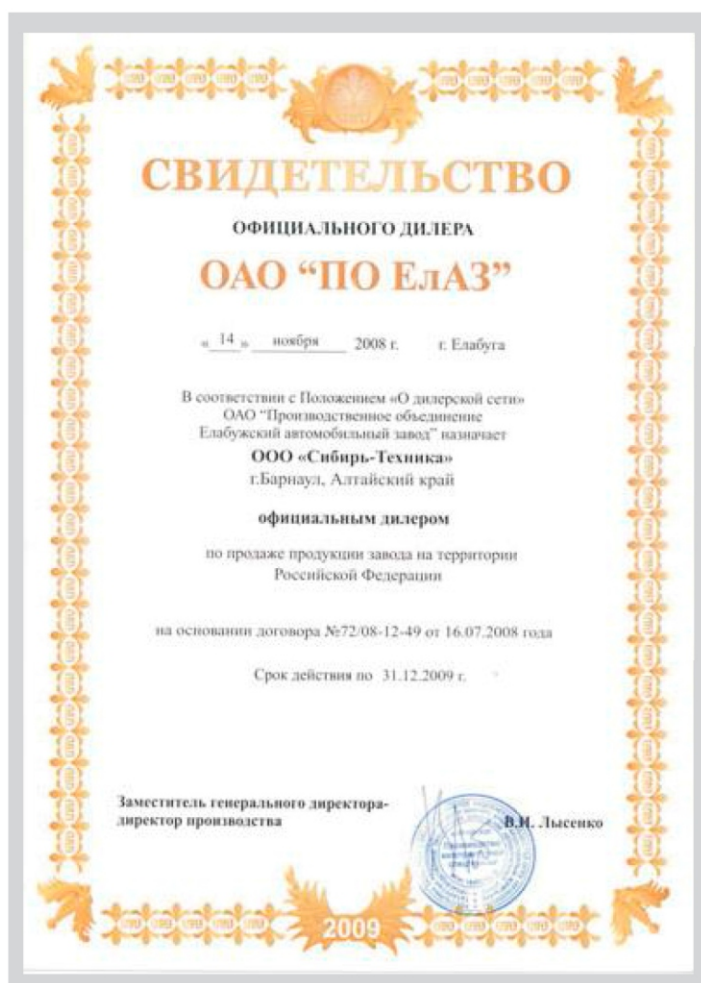
Certificate of ELAZ official dealer

The same year Sibir-Technika concluded a dealer contract with ELAZ, OAO - a manufacturer of motor-and-tractor special machines on the basis of Belarus tractors 82П, 82.1, 80.1. This dealer contract gave Sibir-Technika the right to sell wheeled machines manufactured on the basis of Belarus tractors of various modifications. Annual sales of Belarus 82.1 - type wheeled tractors come up to 400 items.