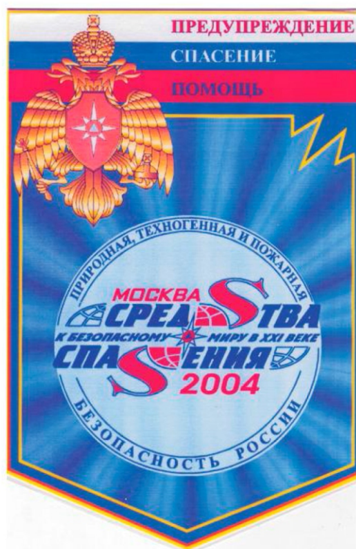
Participation diploma of the 8th International Exhibition organized by Russian Emergency Ministry

Sibir-Technika got a special exhibition diploma for participation with its own-produced TLP-4M forest fire-fighting tractor in the 8th International Exhibition organized by Russian Emergency Ministry and designated as Rescue Equipment-2004. Natural, technogenic and fire safety in Russia.