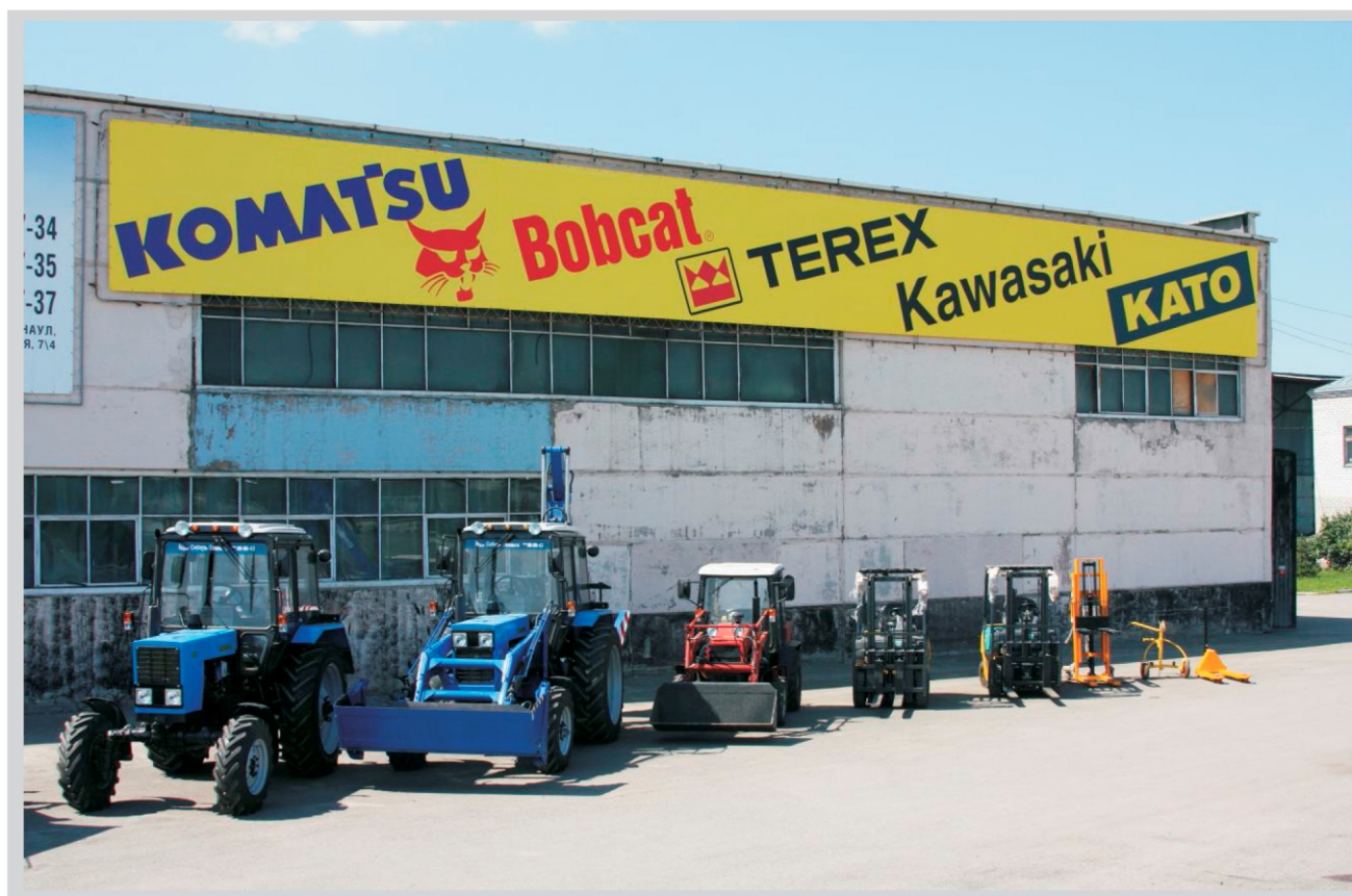
The company has got a wide range of the machines in stock