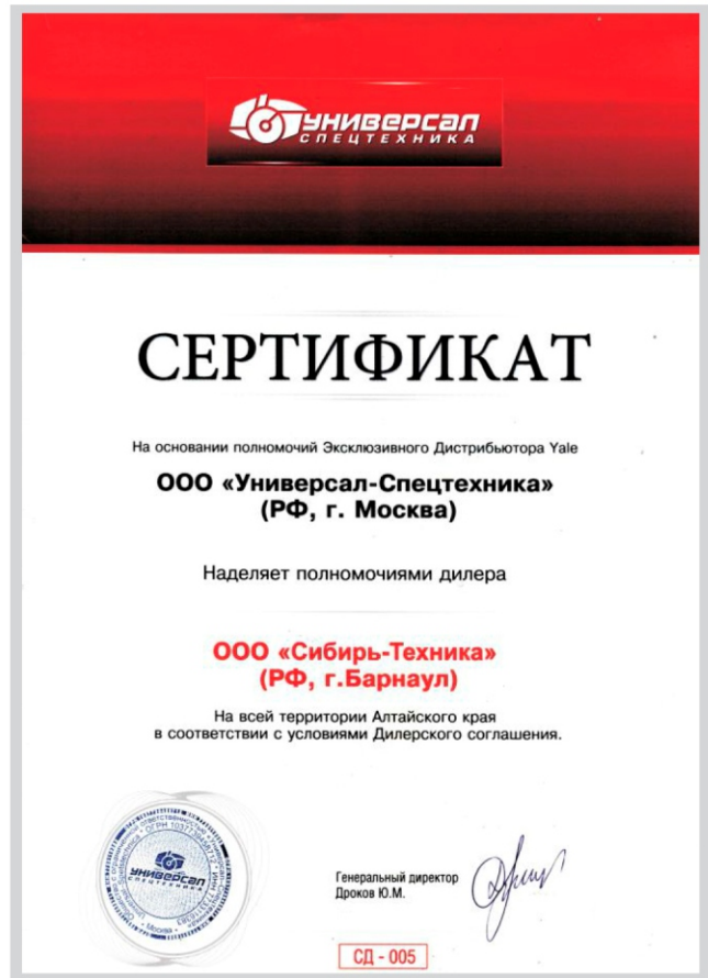
Certificate of Universal-Spetsstechnika official dealer (Yale machines)

In 2010 Sibir-Technika, LLC concluded an official dealership agreement with a distributor of American corporation NACCO Industries, Inc. aimed at purchase of YALE forklift trucks and warehouse equipment.